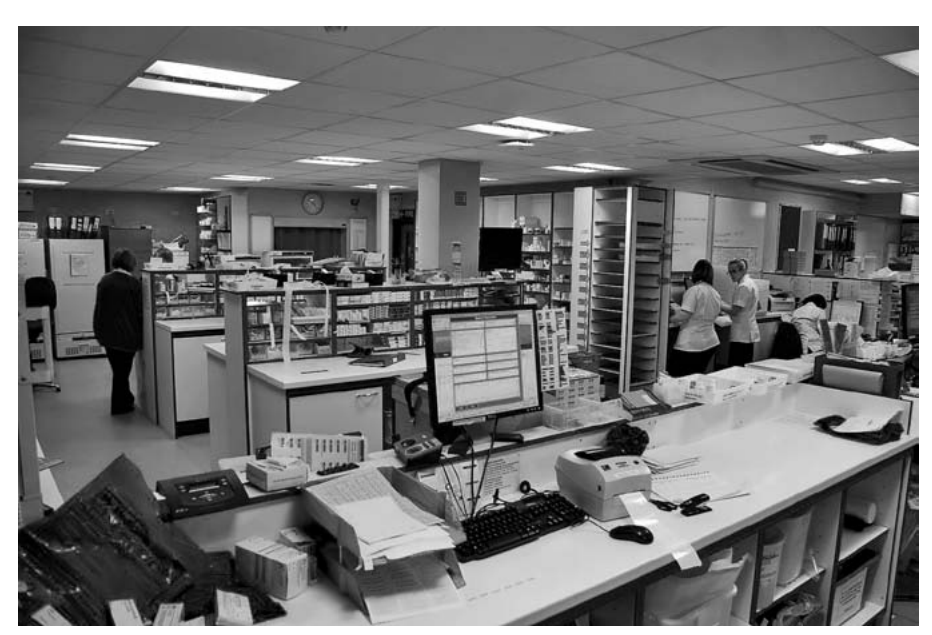
Hospital Pharmacy Dispensary